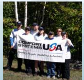
▲ Comfort Systems USA prepares at Whiteface