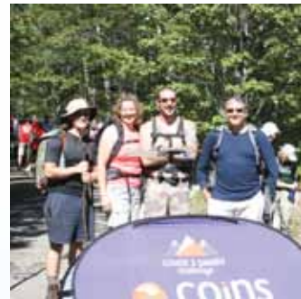
▲ EMCOR-New England Mechanical Services at the start line

At the finish, you'll be greeted by your support crew as well as a celebratory dinner with presentations, awards, medals and t-shirts for all. The evening is rounded out with musical entertainment in the mountain lodge for those who have stamina!