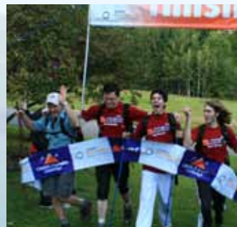
▲ 24hours, 24miles, over 12,000 feet complete