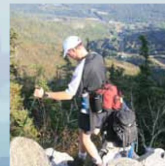
▲ CSArch climber heads back down Whiteface