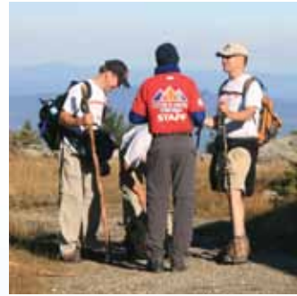
▲ Troy Boiler Works at Mt. Mansfield Check Point #3