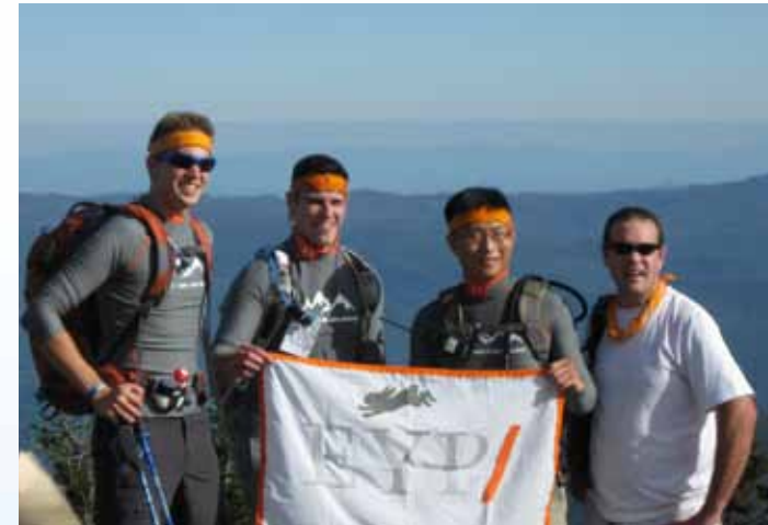
▲ EYP summits Whiteface Mountain at 4,867 feet

We have a dedicated challenge team who will help you get organized, advising on everything from training and nutritional to equipment and accommodations.