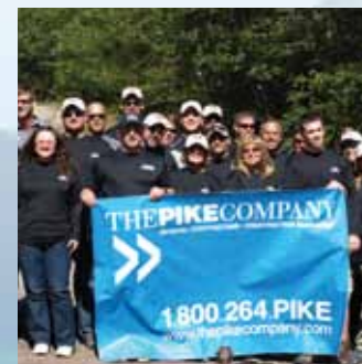
▲ The Pike teams at the base of Whiteface